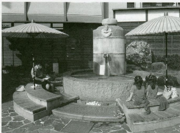
Fig. 2: Ashiyu at Dōgo Onsen, Matsuyama, Island of Shikoku