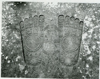
Fig. 5: Buddha's footprint on a stone ( bussokuseki )

Buddha's footprint is made up as follows (figure 5) (a historically solid discussion of the elements in Buddha's footprint would be far too complex to present here; I therefore limit myself to interpretations that are given to the actual present-day visitor at Jōruriji temple near Matsuyama on the island of Shikoku):