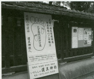
Fig. 9: Entrance board to the Go-ô shrine, Kyoto