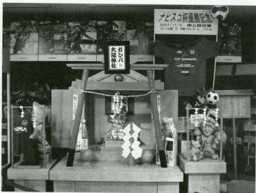
Fig. 10: The Gamba Osaka shrine, in a department store, Osaka, Kita Senri