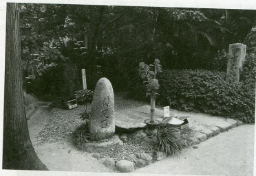
Fig. 6: The bussokuseki at Jōruriji temple, Matsuyama, Island of Shikoku

Have you not left anything behind? Stick, umbrella, juzu (prayer beads), hat, purse, handkerchief, camera and so on? We pray for your safety as you go on your way.“