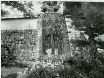
Fig. 7: The bussokuseki at Kôgetsu-in temple, Matsudaira, Aichi Prefecture

I encountered another remarkable bussokuseki in the Kôgetsu-in temple (built in 1641 and venerating Amida Buddha [the Buddha who promises paradise] in the main building) in the dark forest region of Matsudaira in Aichi Prefecture. Here, however, the stone with the footprint was placed vertically, so that the two feet faced the visitor as he approached (figure 7). A young priest sold pretty amulets of Buddha's foot soles and a little golden plate reading, „opening up good luck – warding off evil – traffic safety“. As at Jôruriji temple, here too was a little shrine dedicated to the goddess Benzai-ten.