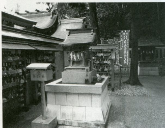
Fig. 8: Ashiô shrine, Hakusan-gû, Nisshin, Aichi Prefecture; to the left and behind can be seen racks with ema

women“. Another shrine was for the Inari deity providing fertility and growth, one for the Akiba deity, protecting one's home from fire, one called „Mountain deity“, procuring the five basic cereals, and one for the Ashi-ô deity, the „King of the Feet“ (figure 8). It was certainly in honour of Ashi-ô – as well as considering the interests of persons coming to pray to the Ashi-ô deity – that this area had been made more easily accessible, as could be gathered from the brand new stone fencing on which stood: „Works to make the premises barrier free“ (for persons having trouble walking). On each pillar of the fence the name of a company that had contributed was engraved. Also, there were large posters in bright and aggressive blue sporting the letters JFA (Japan Football Association) and advertising for Ashi-ô amulets and support for the Nagoya Grand pass eight team.