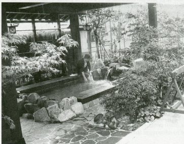
Fig. 3: Ashiyu at Takayama in the Hida Mountains