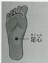
Figure 4: The „heart of the foot“ ( sokushin ) (taken from Ishizaki 2008: 132)