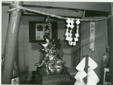
Fig. 11: Gamba Boy